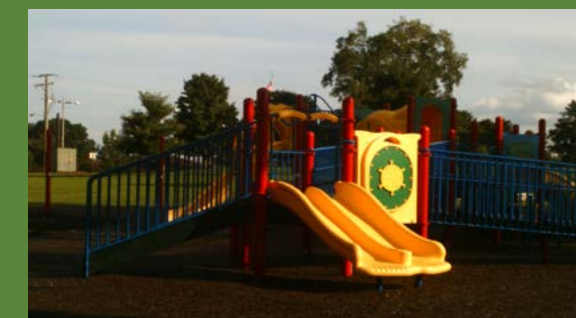
New Playground at John B. Cary Elementary